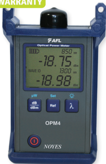
OPM4 Optical Power Meter