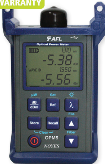
OPM5 Optical Power Meter